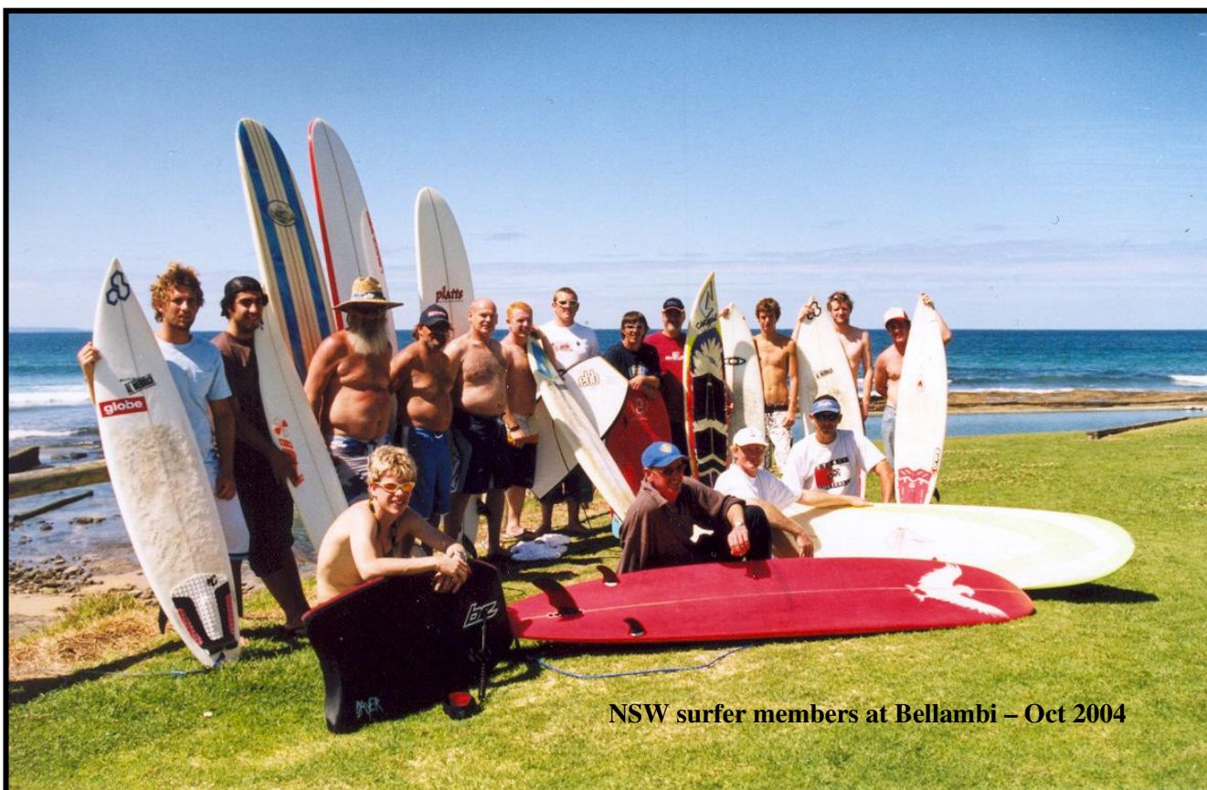
NSW surfer members at Bellambi – Oct 2004