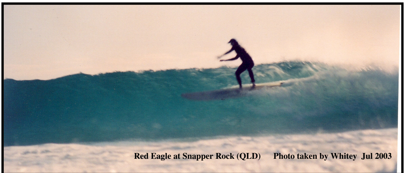
Red Eagle at Snapper Rock (QLD) Jul 2003